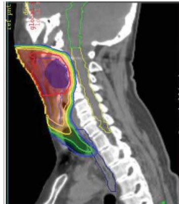
PROTON THERAPY PLAN